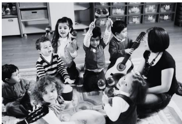
(Photo: Stock Image of young pre-school aged children playing various musical instruments)

connections that would help carry them through this difficult time.