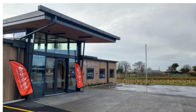
(Photo: The exterior of the BrainTree Centre)

Southern Music Therapy were awarded the Ronnie’s Fund in 2022 that provided support towards our clinic space tenancy at Braintree Wellness Centre in Papanui. We have been able to give those living with Neurologic conditions greater accessibility to Music Therapy within Christchurch. We have children from special education and ORS funding, transitional adults, adults with intellectual disability, adults with neurological conditions like stroke brain injury and Adults with dementia.